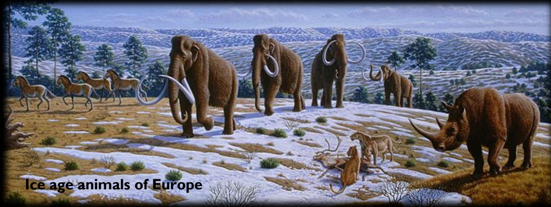
Ice age animals of Europe