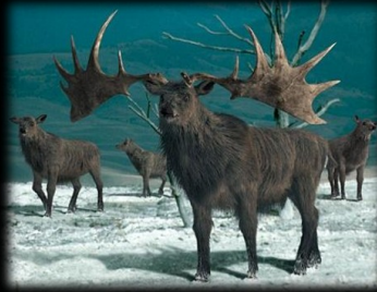
Giant Irish Elk